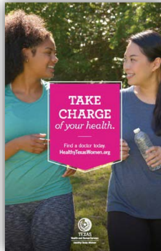
Figure 3. HTW Outreach Campaign Materials Placed in Community Colleges

Direct outreach has been a useful tool to increase awareness of HTW, FPP, and BCCS. HHSC continued to proactively contact organizations that may interact with low-income women and families such as community nonprofits, local shelters and food banks, public libraries, public health departments, and advocacy groups. This outreach method has allowed the opportunity to directly provide organizations with program materials through mail or electronic methods.