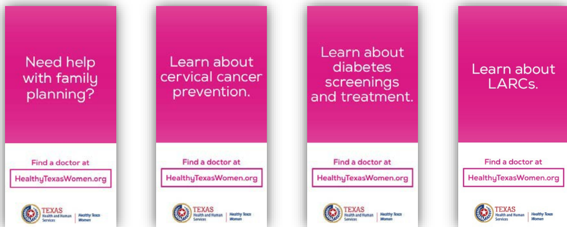
Figure 1. Digital and Social Media Campaign Ad Examples

A paid media campaign has resulted in increased traffic to the HealthyTexasWomen.org website, ultimately connecting the public to important information about program services, client eligibility, how to apply for the program, and how to locate a healthcare provider. The media campaign included digital, social, billboard, and radio advertisements in both English and Spanish. Campaign ads were crafted as a call to action and redirected the audience to HealthyTexasWomen.org.