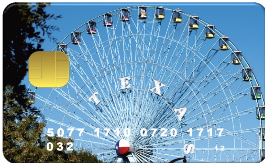
WIC Smart Card - front

Generally, a client's card is loaded with 3 months of benefits. In some cases, a client may have more than one WIC Smart Card. For example, a foster parent will have a smart card for each foster child.