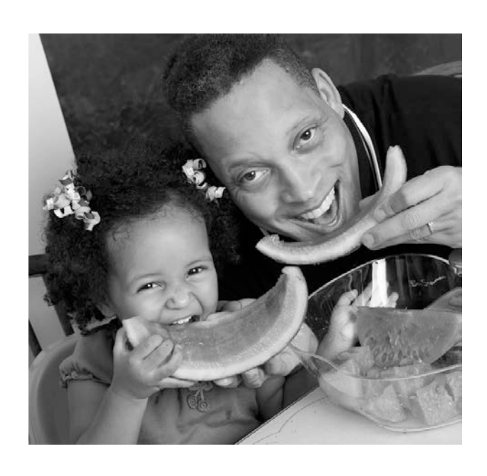
Smart Snacking & Healthy Drinks